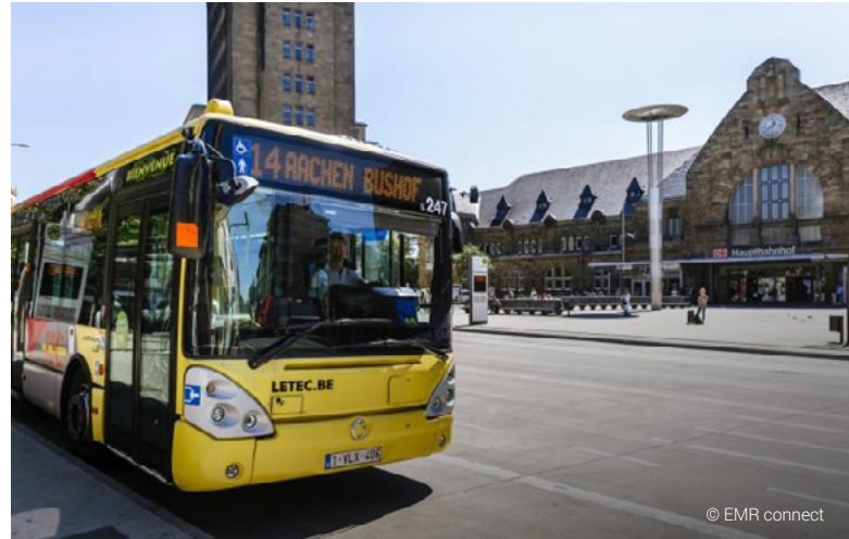
The cross border public transport in the Euregio Meuse-Rhine is managed by a collaboration of several organisations. Perfect thus for finding experts for our workshops.

For implementing the assessment approach, the range of Interreg projects of a specific Interreg programme has to be divided into distinctly demarcated sectors. In our pilot case, the officially existing categorization did not fit with our research goals, as shaped mainly according to political programme objectives and did not necessarily reflect thematic sectors for which specific networks and CBC qualities may be detected (described in detail in the Research Report).